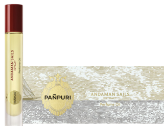
ANDAMAN SAILS EXTRACT Perfume Oil