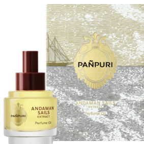
ANDAMAN SAILS EXTRACT Perfume Oil